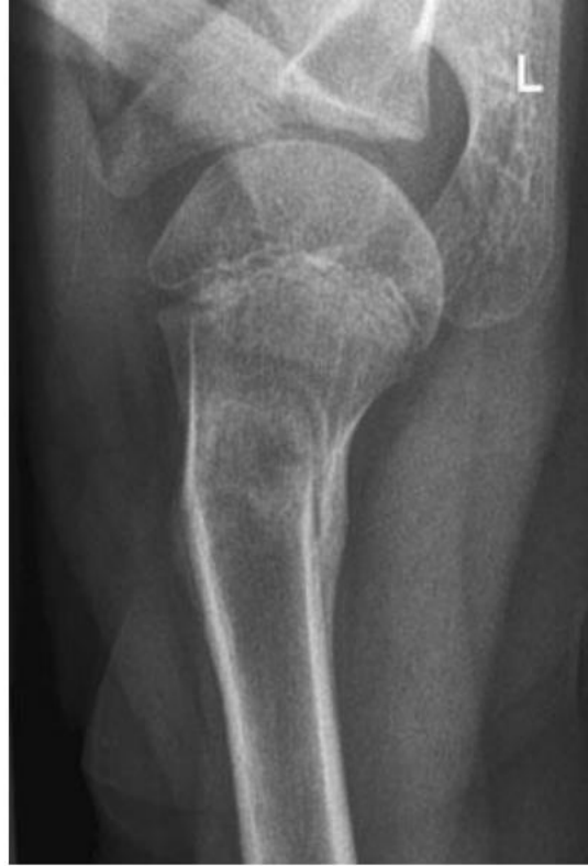
Superio-inferior projection for neck of humerus, showing healing angulated fracture of proximal shaft of humerus