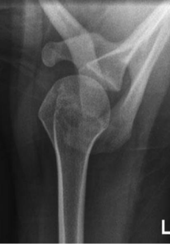
Normal superio-inferior projection to show neck of humerus