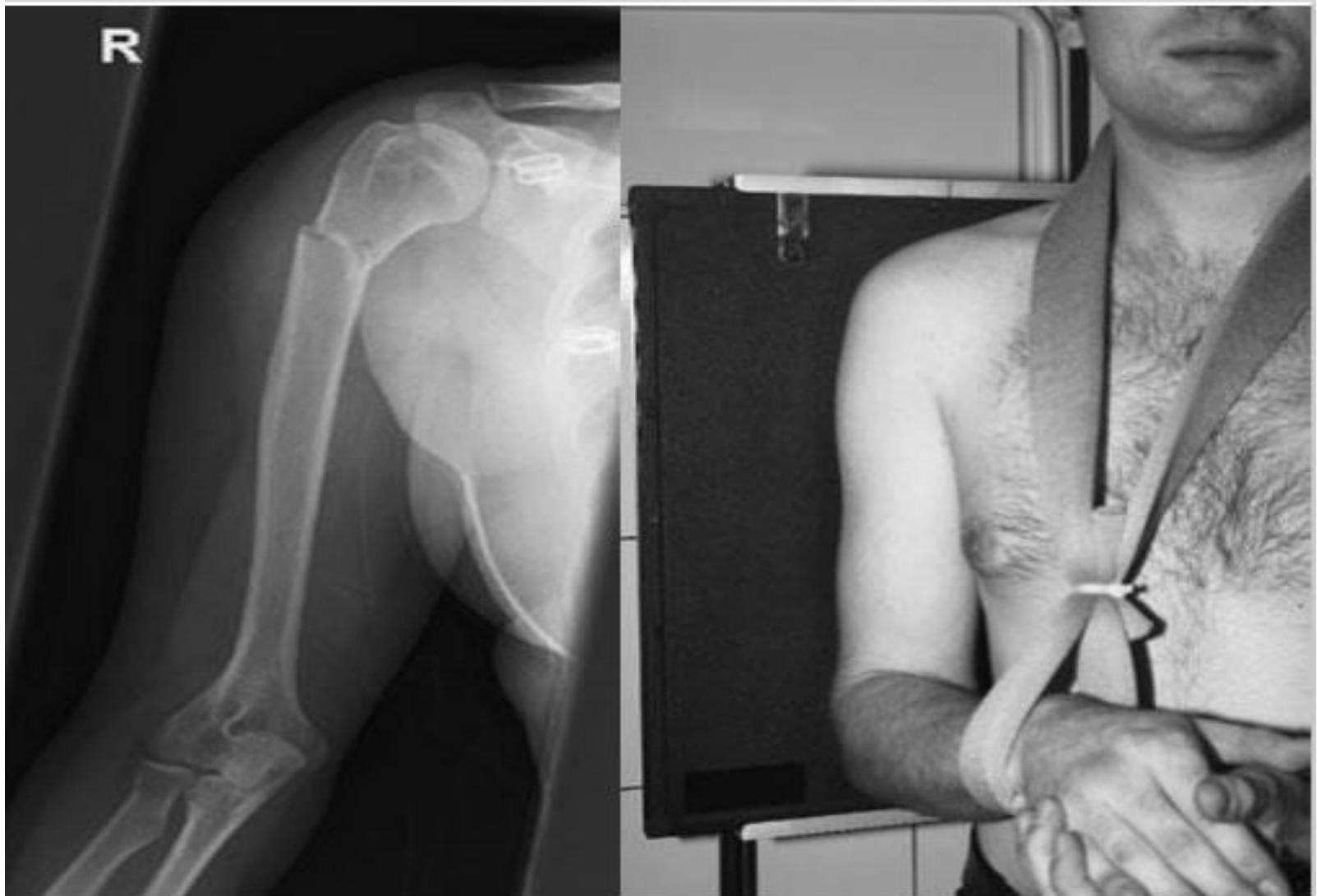
Antero-posterior radiograph of humerus showing a fracture of the proximal shaft of the humerus