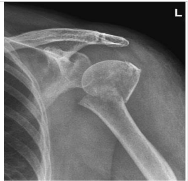
Antero-posterior radiograph of neck of humerus taken erect to show fracture of the neck of the humerus